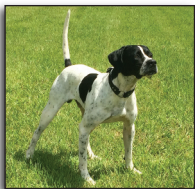
One Day Frost 2021 ASD Winner