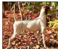
FOX BROOK POKER FACE Chad Wheeler, Owner/Handler