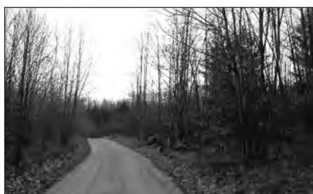
The trial begins.