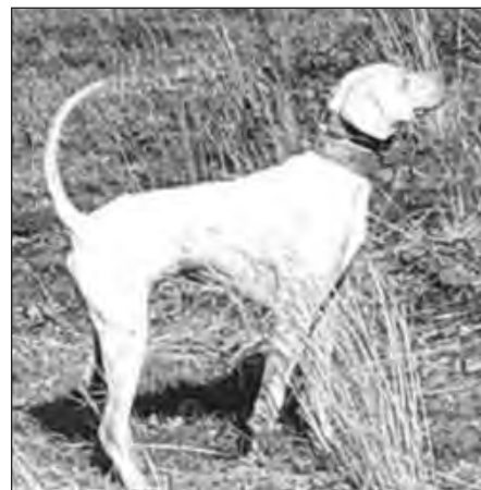
Erin's Envy, Runner-Up in the 96th New England Open Shooting Dog Championship

In the early years, there seemed to have been a division between the traditional close-hunting New England grouse dogs and the more wide-ranging