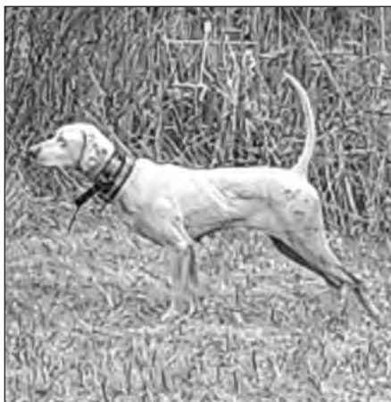
Miller's Special Cinderella, Winner of the 96th New England Open Shooting Dog Championship.