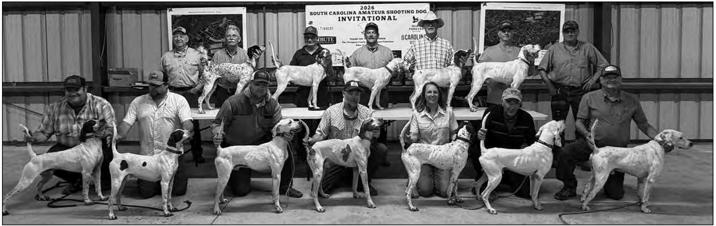
All 12 dogs during Thursday's celebration dinner and drawing.