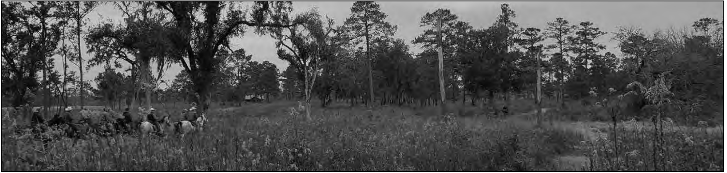
Passing the Hagan House just after the Saturday afternoon breakaway.