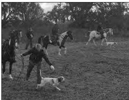
Haney's All In and T S Coal Train off Thursday morning, 7:58.