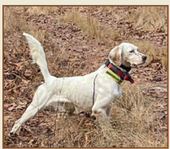
"Jake" SBHA Horseback Open Derby of the Year & Open Horseback Dog of the Year