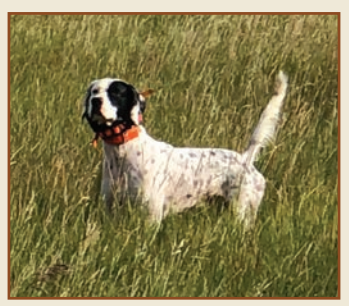
"Shooter" R-U, SBHA Horseback Open Shooting Dog of the Year