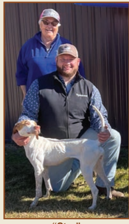
"Star" R-U, SBHA Horseback Open Puppy of the Year