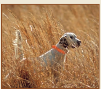
Merritt's Buck Ch. Smoke Rise Buck Ch. Merritt's Pearl Ch. Merritt's Zackery