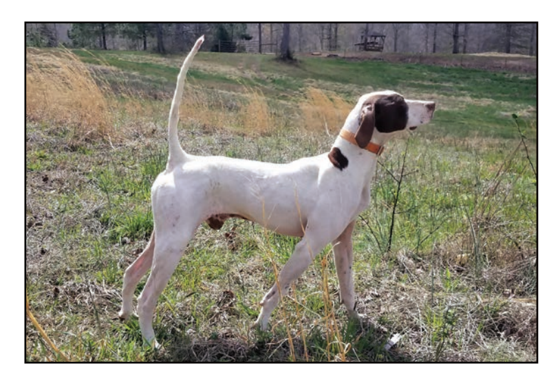
Mohawk Mill Gangster