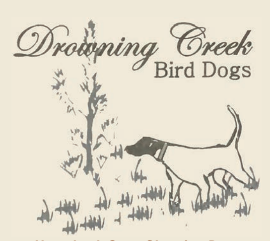
Horseback Open Shooting Dogs