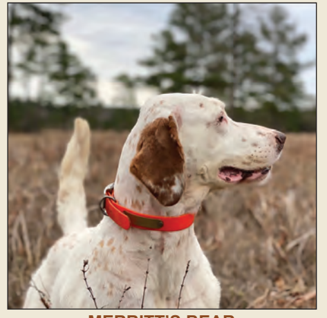
MERRITT'S BEAR Ch. Smoke Rise Buck Ch. Merritt's Pearl Ch. Crescent City Dexter

Ch. Funseeker's Rebel, HOF Ch. Fiddler, HOF Ch. Miller's Silver Bullett