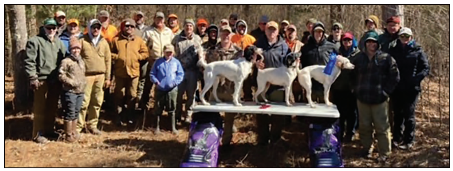
Large contingent of field trial participants with Open Shooting Dog winners.