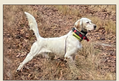
SHAGTIME SMOKE Ch. Smoke Rise Buck Ch. Ridge Creek Cody Ch. Houston's Belle