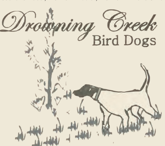
Horseback Open Shooting Dogs