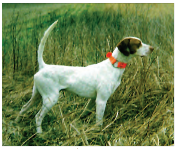
BEELER'S TEXAS JIG 1st, Heartland Open All-Age 1st, Cajun Derby Classic | 2nd, Heartland Derby Five crosses to Miller's White Powder in 5 generations.