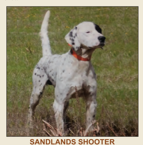
Hytest Palladin Ch. Blue Diamond Ch. Hytest Sky Hawk Ch. Pinekone Max Jr. Ch. Pinekone Max