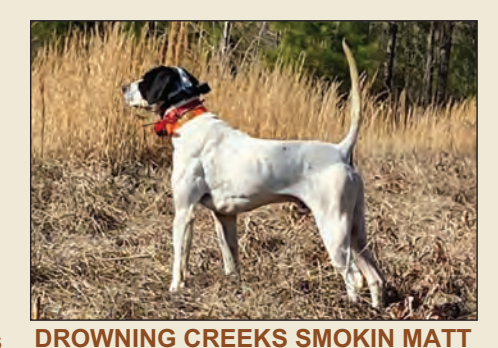
Ch. High Drive Rocky HOF Ch. Rock Acre Blackhawk Ch. Miller's White Powder

We would like to thank our owners and supporters as our program moves forward. God bless you all! We would also like to congratulate UKC® on their purchase of The AMERICAN FIELD and praise them for restarting a print copy.