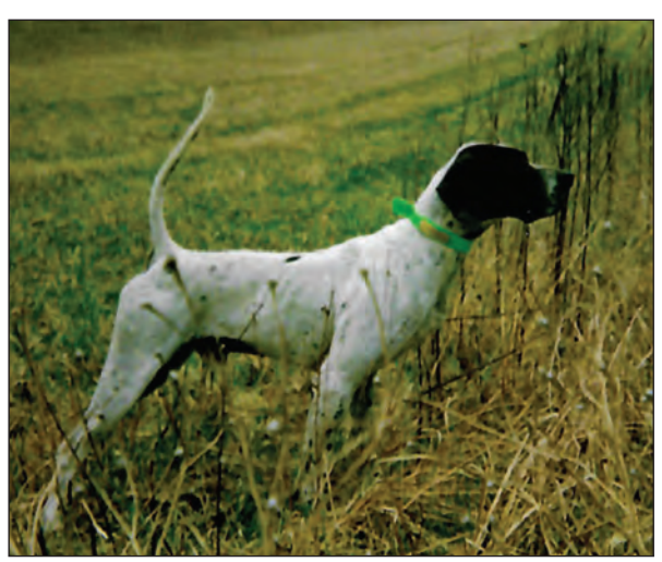
BEELER'S BLACK JACK 3 – First Places | 2 – Second Places Two crosses to Elhew Strike in 5 generations. May be the savior to the Elhew line.